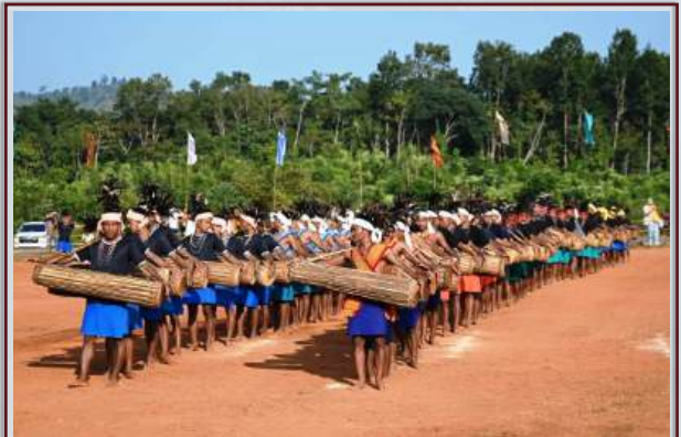
Wangala Festival – Tura (07 November 2025)

Adding to the experience, visitors can savor authentic Garo delicacies, witness age-old rituals, and immerse themselves in the indigenous way of life. For culture seekers, the Wangala Festival offers a deep dive into the living traditions of Meghalaya’s hills.