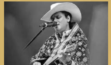
Zubeen Garg (1972-2025)

We are deeply saddened by the passing of Zubin Garg, the legendary voice of Assam. His soulful melodies touched millions and will forever remain in our hearts. Our heartfelt condolences to his family, friends, and admirers. May his soul rest in peace.