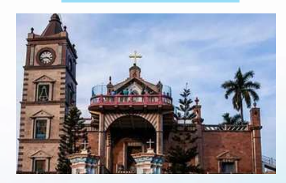
Bandel, West Bengal

Bandel is a town located in the Hooghly district of West Bengal, India.